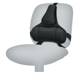
Back and Foot Supports